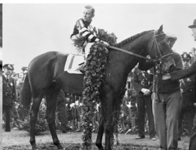
WAR ADMIRAL 1937