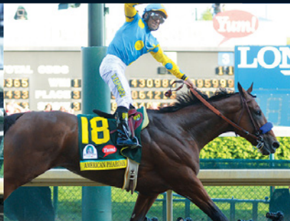
AMERICAN PHAROAH 2015