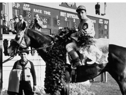
COUNT FLEET 1943