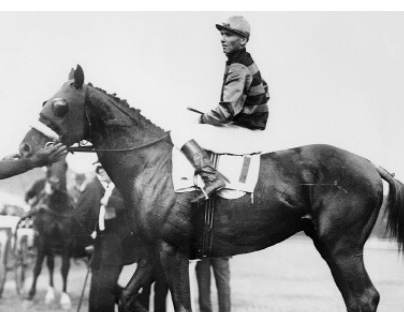
SIR BARTON 1919