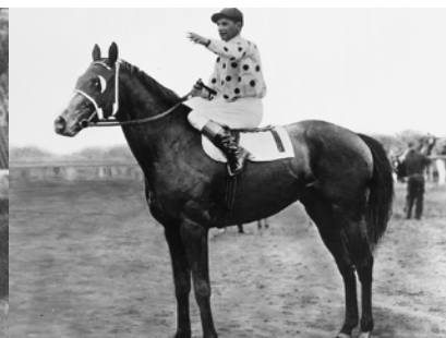
GALLANT FOX 1930