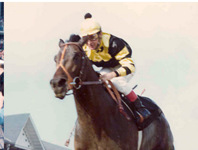
SEATTLE SLEW 1977