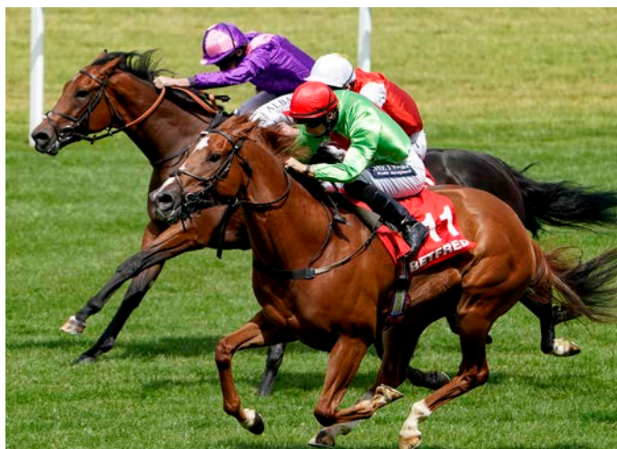
Tone The Barone