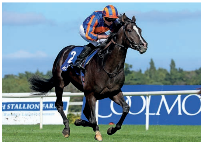
Auguste Rodin ridden by Ryan Moore wins at Leopardstown

"He's more of a three-year-old type, his pedigree would lead you that way and he'll stay a good deal further than 1m. Ground is quite important to him, especially at this stage in his career, so that's why we've opted for Doncaster over Newbury (Horris Hill Stakes)."