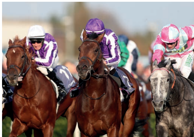
Magna Grecia wins the 2018 Vertem Futurity Trophy