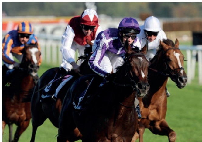
Camelot claims Group 1 glory in 2011 at Doncaster

1st COLD STARE (5) 2nd ZIP (3) 3rd RICH WATERS (13)