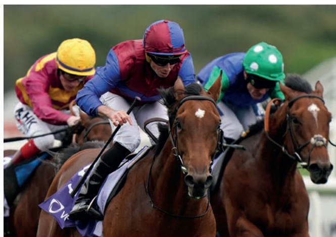
Luxembourg wins the 2021 Vertem Futurity Trophy