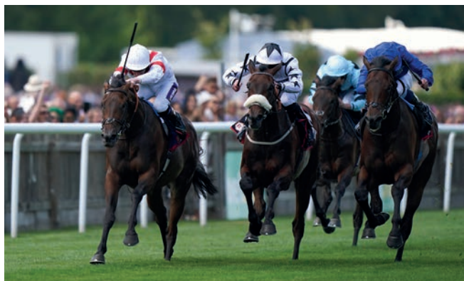
Deauville Legend on the way to winning at Newmarket racecourse