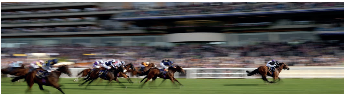
Rhythm N Hooves ridden by Hollie Doyle wins at Royal Ascot

"The 9lb hike up the rankings that he was hit with after his Royal Ascot win looks harsh, to say the least. He takes on the older horses on ground softer than he's previously encountered, but at least we know he's effective over course and distance and we have a good middle draw in stall 7."